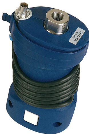
External IDOS universal pressure module

*Provides absolute pressure option in addition to gauge pressure. In absolute mode adds barometric pressure to gauge pressure range. For absolute mode ranges below 1 bar please consult your sales representative.