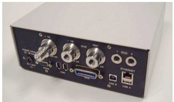
PACE1000 from the rear

Premium precision – IRS2 Reference precision – IRS3 Standard precision – IRS0-B High precision – IRS1-B Premium precision – IRS2-B Reference precision – IRS-B