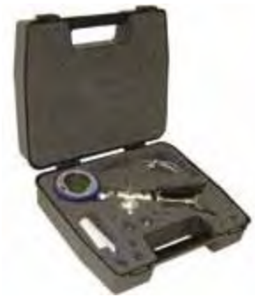
Pneumatic test kit