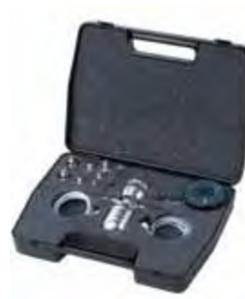
Low pressure pneumatic test kit

Includes: DPI 104-IS; ranges to 10,000 psi (700 bar), PV 411A combined pneumatic and hydraulic test pump, hydraulic reservoir, hose, adaptors, seal kit and case.