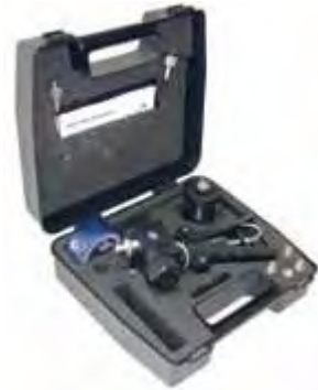
Pneumatic and hydraulic test kit